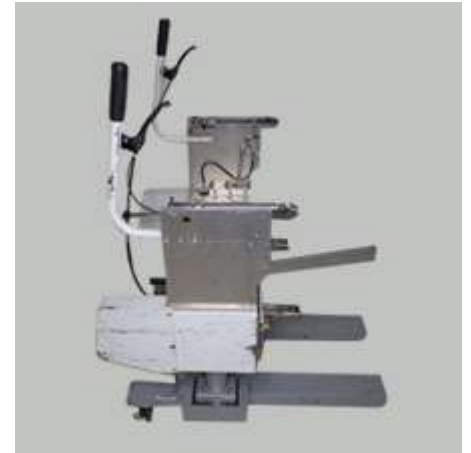
M6 Pallet Change Unit (Reel Type)