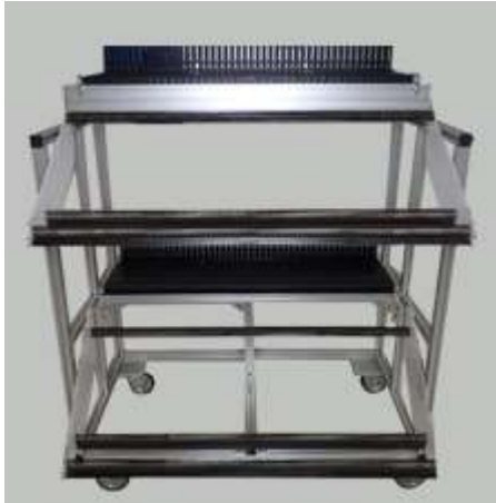
Feeder Storage Rack (Reel Type)