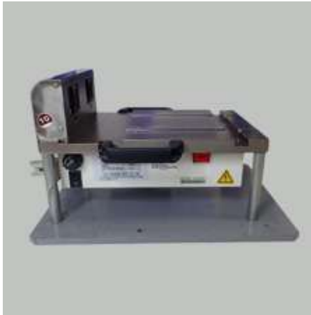
Reel Setting Stand