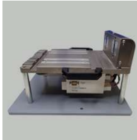
Reel Setting Stand