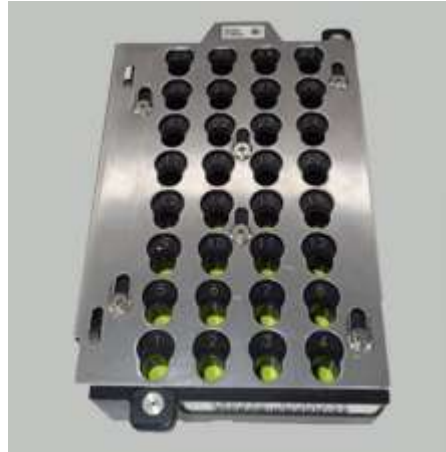
H12/H08 Nozzle Changer Nest