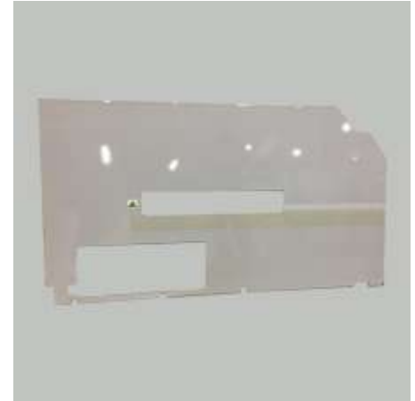
NXT Seamless Covers