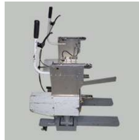
M6 Pallet Change Unit (Reel Type)