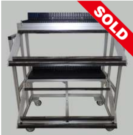
Feeder Storage Rack (Reel Type)