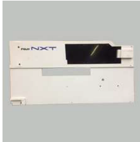
NXT Side Covers