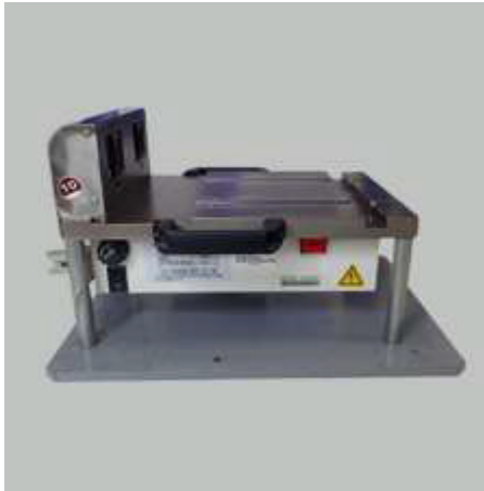
Reel Setting Stand