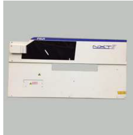
NXT-II Side Covers