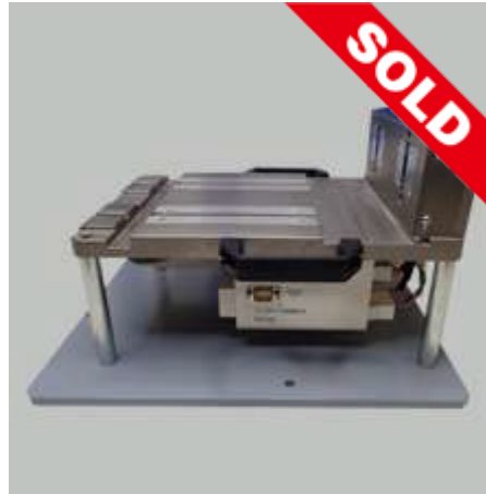
Reel Setting Stand