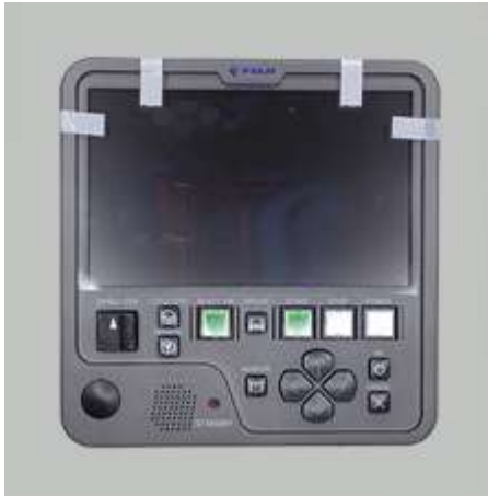
AIMEX Control Panel