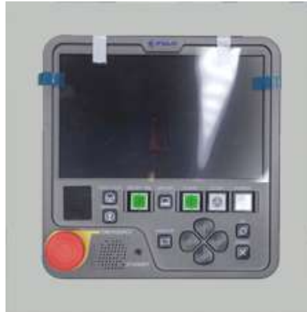
NXT Control Panel