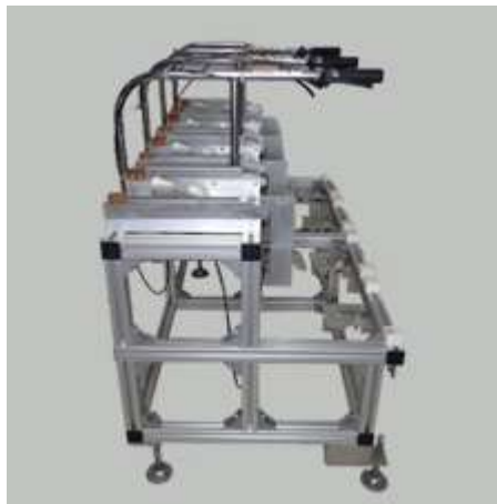
M3 Pallet Storage Unit