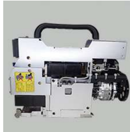
H08 Placement Head