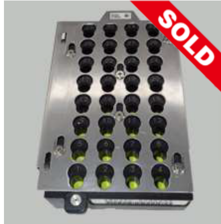
H12/H08 Nozzle Changer Nest