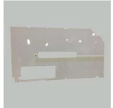
NXT Seamless Covers