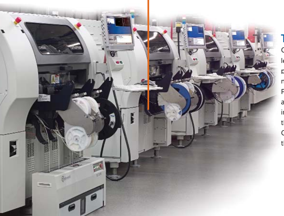
Genesis will energize your high-performance assembly in any production environment 77

Genesis offers the best in modular performance, delivering the flexibility you want and the performance you need. Based on the platform philosophy originated by Universal Instruments, Genesis provides commonality and scalable performance with single, dual, and quad-beam models for maximum productivity at all volumes regardless of product mix.