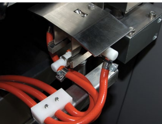
Pressure controlled flux supply with stepper motor drive for precise, repeatable flux application