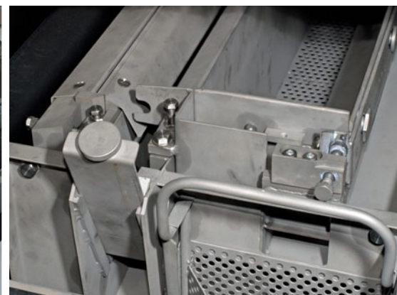
Titanium components with unique dross management design