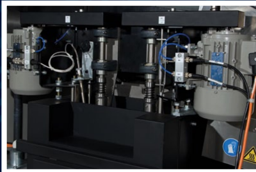
Reliable frequency inverter driven motors