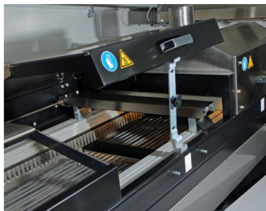
Preheat configurations for process flexibility: IR calrod, quartz lamps, and forced convection