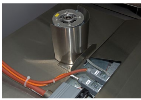
Recipe driven forced convection fan speed control